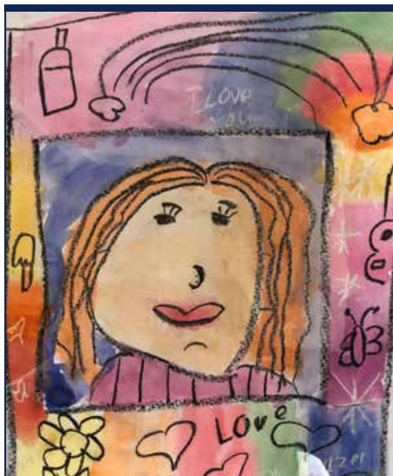
This is my drawing of how God teaches us to care for creation. First Name, Year Level

Schools can choose to have one (or more) of their student's artwork formatted into a prayer card.