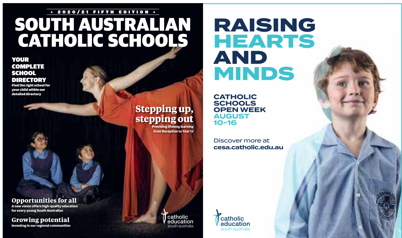
above Advertiser magazine 2020 - Front and Back Cover

This magazine will reach a statewide readership of over 300,000 people. Additional copies are distributed at events such as the Pregnancy, Babies and Children's Expo.