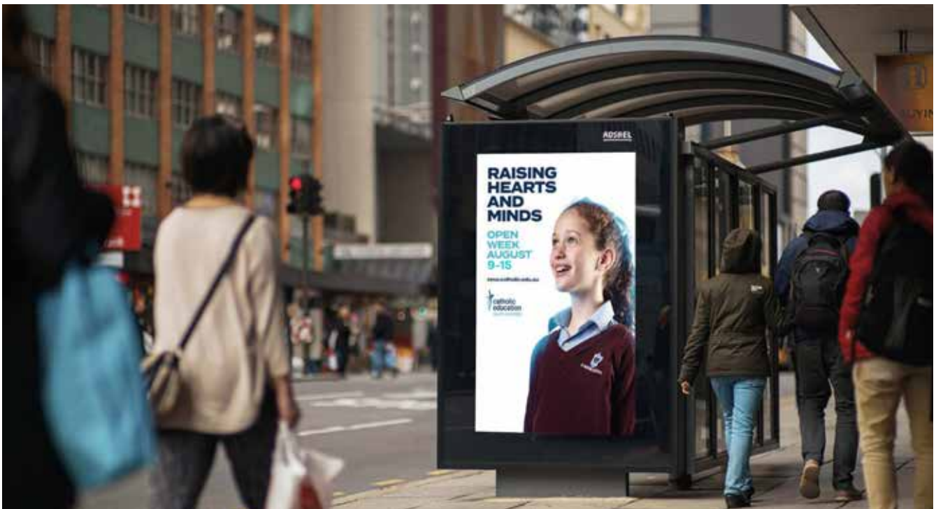
above example of digital bus shelter advertising for CESA campaign

See oOh!media proposal for more specific information on options and timing.